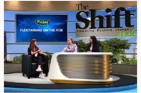
Food Security & Tech-For-Good ft. Phuture Foods