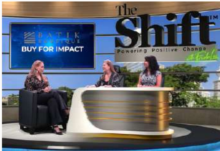
Sustainable Fashion ft. Batik Boutique