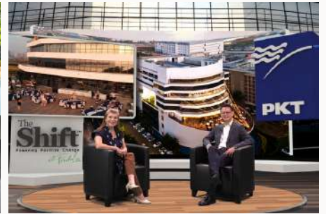
Green Mobility & Transport ft. PKT Logistics Group