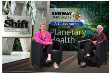
ESG Support, Consulting, & Education ft. Sunway Centre for Planetary Health