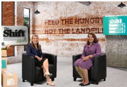
Zero Waste ft. Coca-Cola