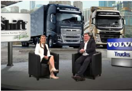
Green & Renewable Energy ft. Volvo Trucks