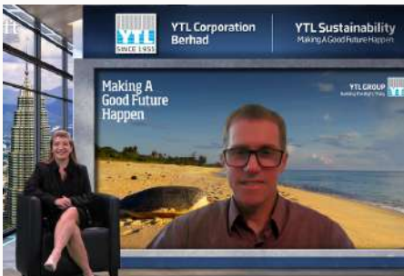
Responsible Tourism & Hospitality ft. YTL Corporation Berhad