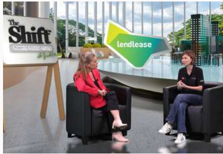
Green Design ft. Lendlease